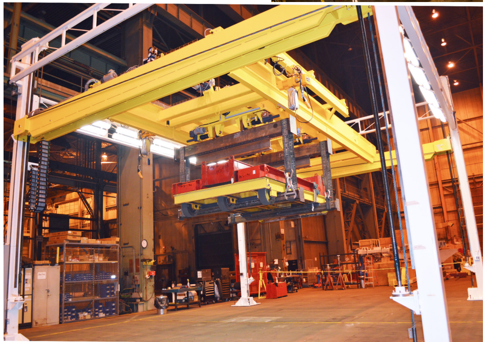
Handling Specialty's jet engine dress bay lifting system undergoing a weight test in our Plant 2 high bay facility.